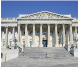
ADP Budget: Potential Reductions to the Department of Defense's Budget Request: IMTEC-90-12