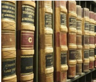
THE TORCH AND COLONIAL BOOK CIRCULAR, VOLUME 4